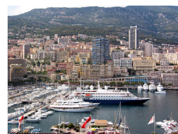
Your own private vantage point for the Monaco Grand Prix

And if you are ahead of the game, 2012 will present some great charter opportunities when the Olympics are staged in London. Plenty of berthing opportunities are available along the Thames and you can also sail the ships to Portland for the sailing events.