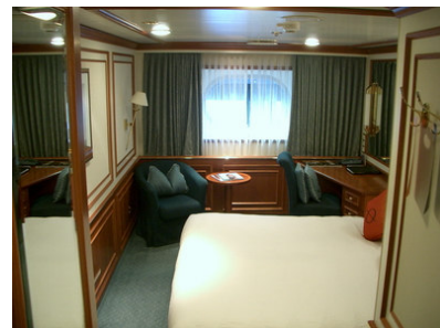
Typical cabin on the Orion

Orion offers a range of included and optional shoreside expeditions designed to enhance the destination exploration for your guests. From Mal-lard sea plane flights and out-back 4WD tours, to snorkelling over pristine coral formations, there are many unique opportunities for guests to visit areas of Australia that even most Australians don't get to see.