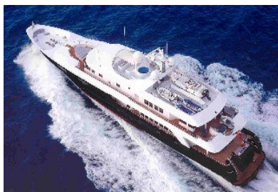
MY Perfect Persuasion

Horace Dodge of Dodge Cars fame, which can sleep up to 28 guests, but can cater for more for in-port functions. ( SS Delphine is the only steam ship yacht in the world and has a pristine engine room waiting to be explored). Or you can choose a more contemporary yacht such as Perfect Persuasion which can sleep up to 10 guests.