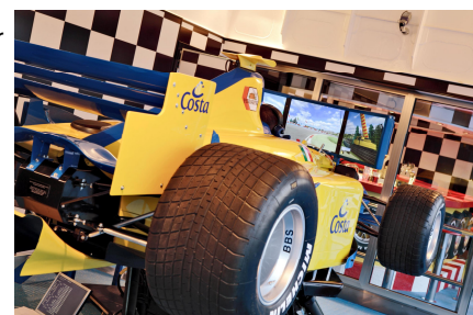
Test your skills on the Formula 1 Simulator