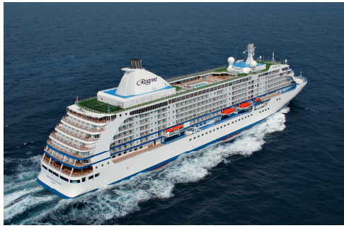
Seven Seas Voyager