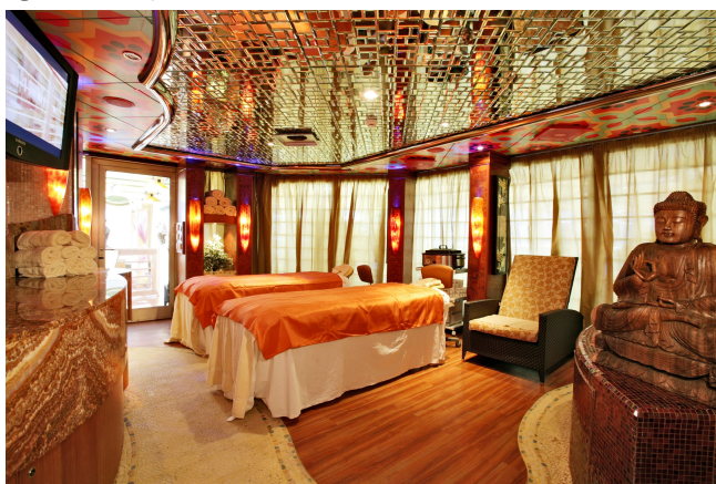
Treatment room in the Samsara Spa

"Samsara - a word associated with the path to spiritual enlightenment, beauty and balancing of life energies."