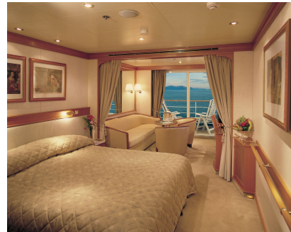
Seven Seas Voyager & Mariner boast all outside suites with private balcony