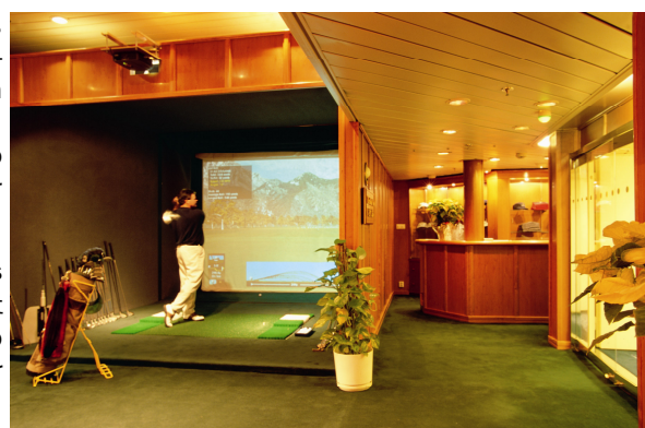
Golf simulator aboard the Prinsendam

(Clubs that is - we don't expect you to bring your own buggies!)