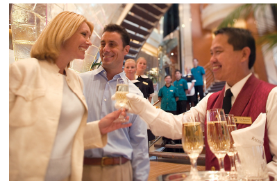
A warm welcome awaits

ding will match, with fine cashmere throws, perfect for lounging in suite or on private balconies. Soft bathrobes and towels will await guests in their bathrooms, which will also feature new Regent luxury bathroom amenities.