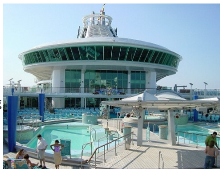
One of the three swimming pools onboard