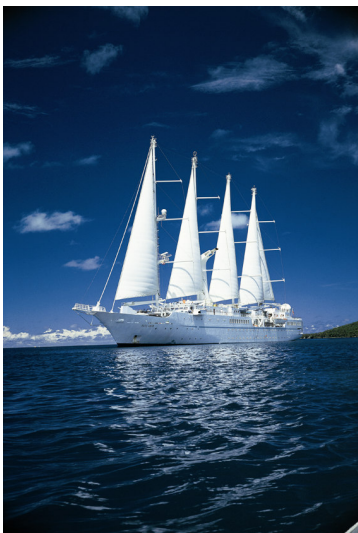
Enjoy an array of watersports from the ships marina

“Sail under a moonlit sky, with the sails fluttering overhead”