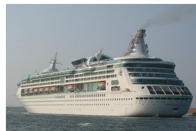
Rhapsody of the Seas

Rhapsody of the Seas , which will operate these sailings, has much to offer her guests including two swimming pools (one with a retractable glass roof), a grand restaurant spread over two decks, a rock climbing wall and an 18 hole miniature golf course. There is also a conference centre for up to 126 delegates.