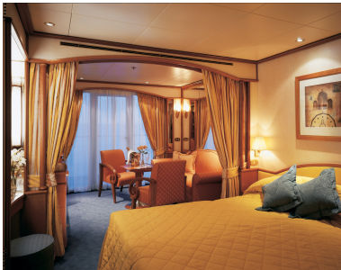
All Suite accommodation, most with a Private Veranda