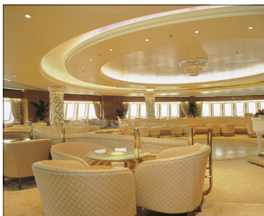
Saga Rose is a "Country Club at Sea"