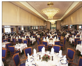
Single Seating Dining in the Restaurant

What was even better, Saga were prepared to create a special 4 night itinerary for us by changing one of their published sailings. Hat's off to Saga for this and getting the programme within budget.